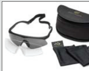
U.S. Military Kit

**See Price List for product numbers and descriptions.