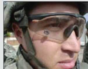
Lt. A's eyesight was saved by the Sawfly System