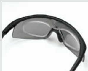
Optional Rx Carrier