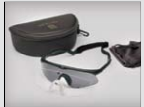
U.S. Military Kit