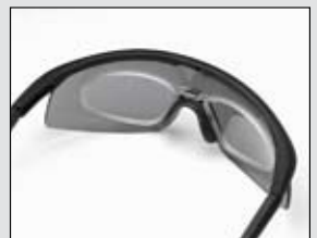
Optional Rx Carrier