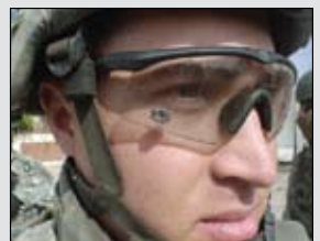
Lt. A's eyesight was saved by the Sawfly System